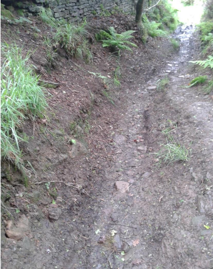
Example of proposed pitched surface